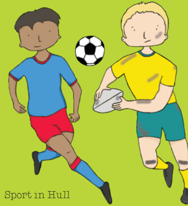
Sport in Hull

As a Hull Curriculum member, we want to recognise and celebrate your school's commitment to connecting your children with their local heritage. Each school that takes part in a Pop-Up Exhibition will have the opportunity to showcase your children's learning outputs. Your pupils' work will take pride of place in an annual exhibition in the Museums Quarter helping to celebrate their achievements.